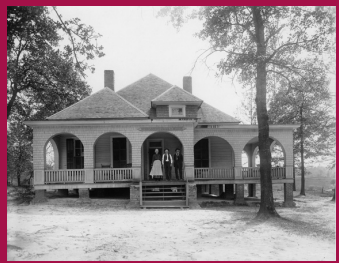
Blue and Grey Cottage

Admission is $2 per person and the program will take place inside the museum. Call 205-755-1990 for more information.