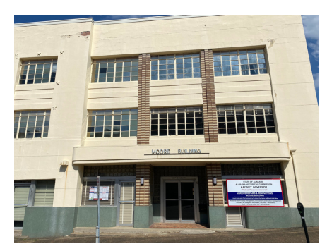
Historic Moore Building downtown Montgomery

The building retains its original steel windows, corridors, staircases, elevator and Art Moderne motifs. Phase I of a multi-phase rehabilitation project includes site work, roof repairs, hazardous material abatement, and demolition of non-original material. Once the project is complete the first floor will be used to support the operation of the Freedom Rides Museum with additional educational, programming, retail and office space.